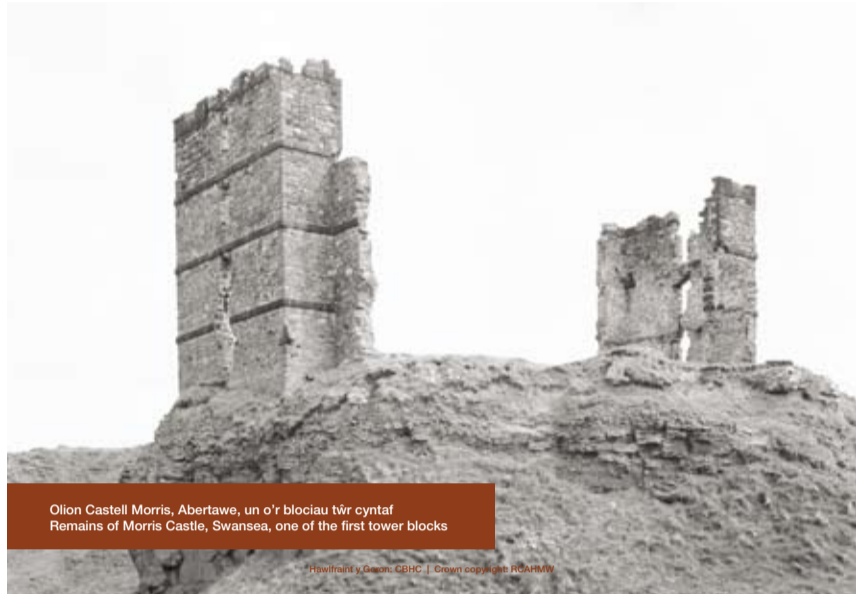
Oilon Castell Morris, Abertawe, un o'r blociau tŵr cyntaf Remains of Morris Castle, Swansea, one of the first tower blocks