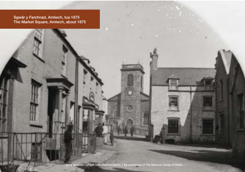
Sgwâr y Farchnad, Amlwch, tua 1875 The Market Square, Amlwch, about 1875